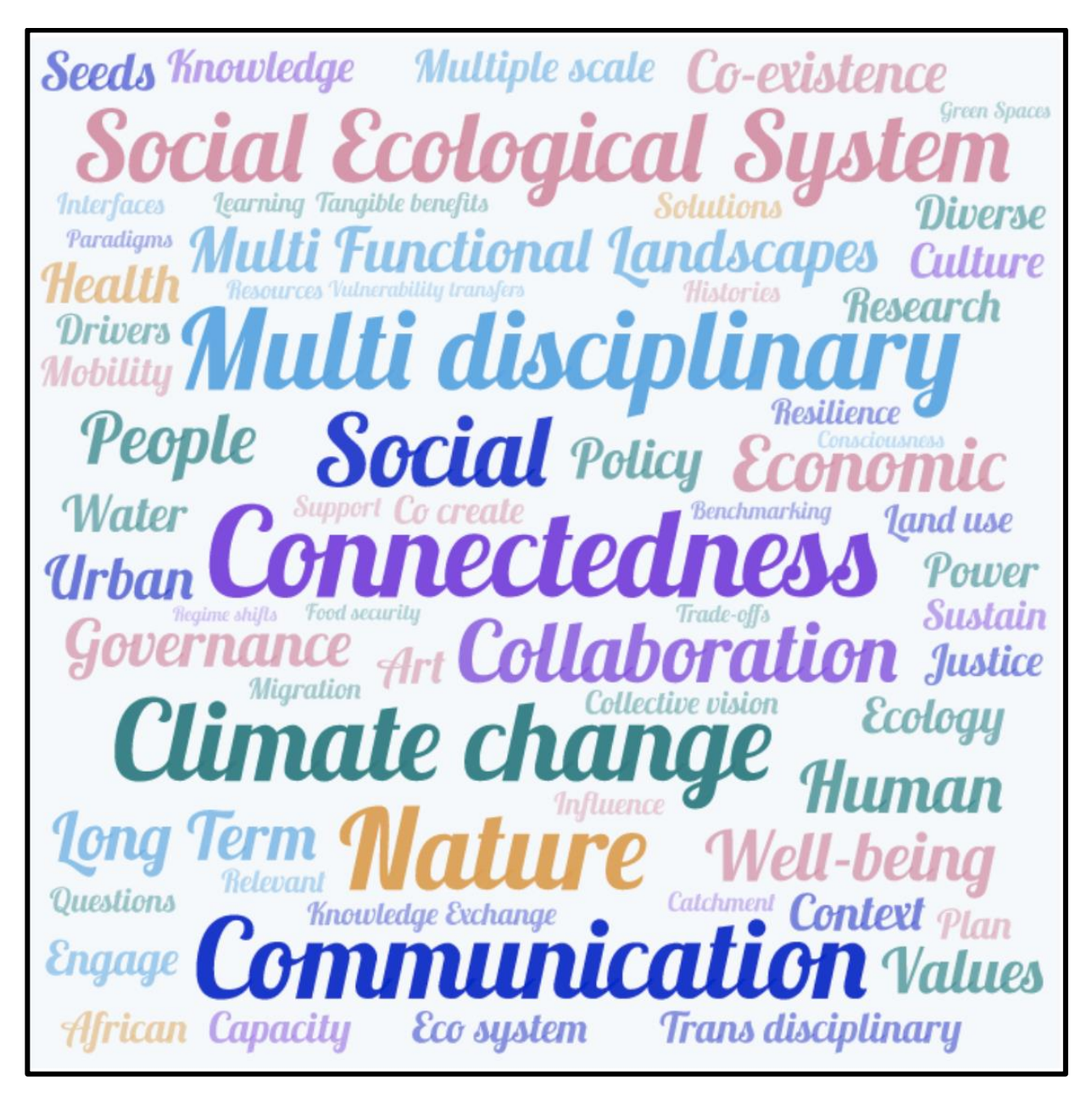
Figure 2. Wordle derived from the text captured from small group dialogues

The participant deliberations in the small group dialogues were captured on flipchart papers and later transferred into an electronic format for ease of analysis. An adapted Wordle (<u>https://wordart.com</u>) of the text captured on flipchart papers provides an overview of the words commonly used in the conversations. See Figure 2.