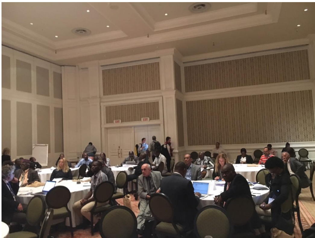
Participants in the SRU session at the Future Earth, Seedbeds of Transformation Conference held on the 11 th of May 2018